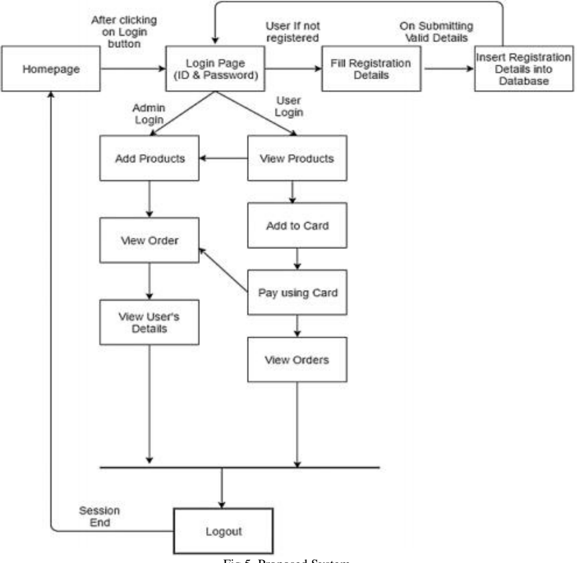
Fig.5 Proposed System

Considering the major anomalies into the existing system, we conclude to build this proposed system. The highlighted part here is encryption of card data using AES (Advanced Encryption Standard) technique. The Online Shop secures the card payment and won't let the card data to get hacked. While user doing a card payment, all the card data is encrypted and then stored into database. System also keeps user details in an encryption form using AES encryption. The system is built of handling SQL Injection capabilities which doubles the security of database and prevents from injection hacking codes into the database. In the proposed website there are different parts or modules which are summarized as follows: