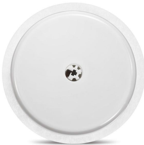
Fig.2. FreeStyle Libre sensor

FreeStyle Libre is composed by a Sensor (Fig. 2) and a device reader. Blood glucose detection occurs only when the device reader is manually passed over the sensor. In this study we have used only the sensor.