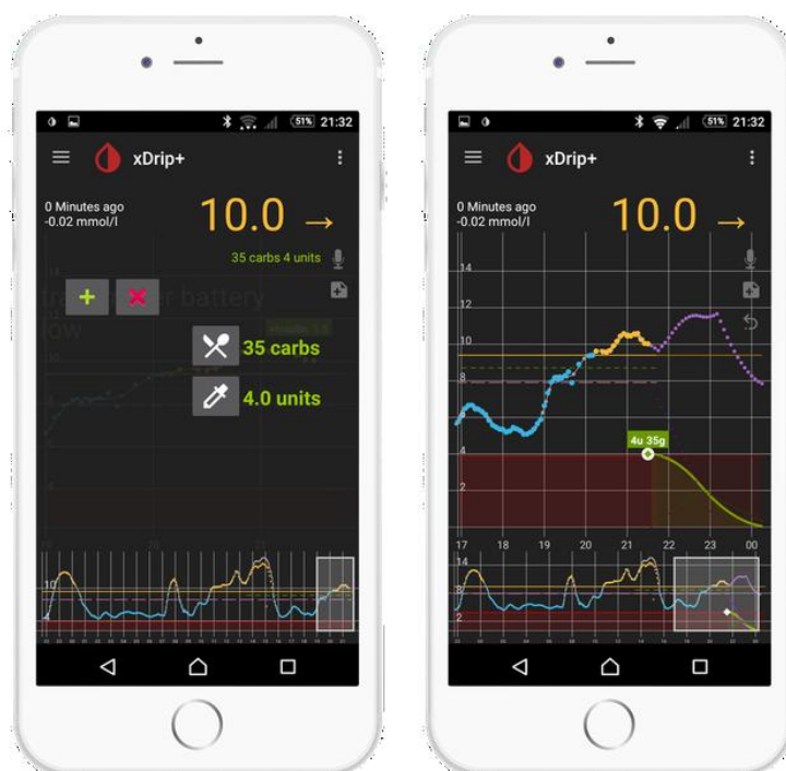
Fig.4. xDrip+ software

The most important feature of this project is having a night monitor, wearable like a simple shirt or headband.